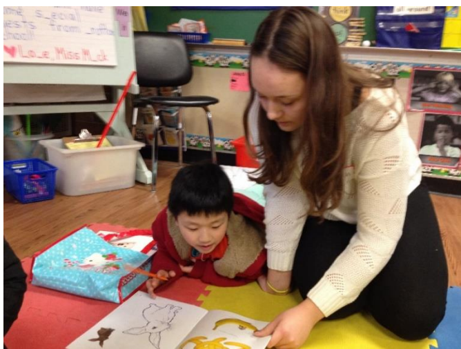
Ceilidh participated in the RBS while at Crofton House School in Grade 10

Ultimately, reflective writing can be extremely helpful in aiding thought processes and synthesizing experiential learning. Certainly, verbal reflection is important, and helps classmates compare and contrast experiences, allowing for considerable cross-talk and the emergence of an array of different ideas and thoughts.