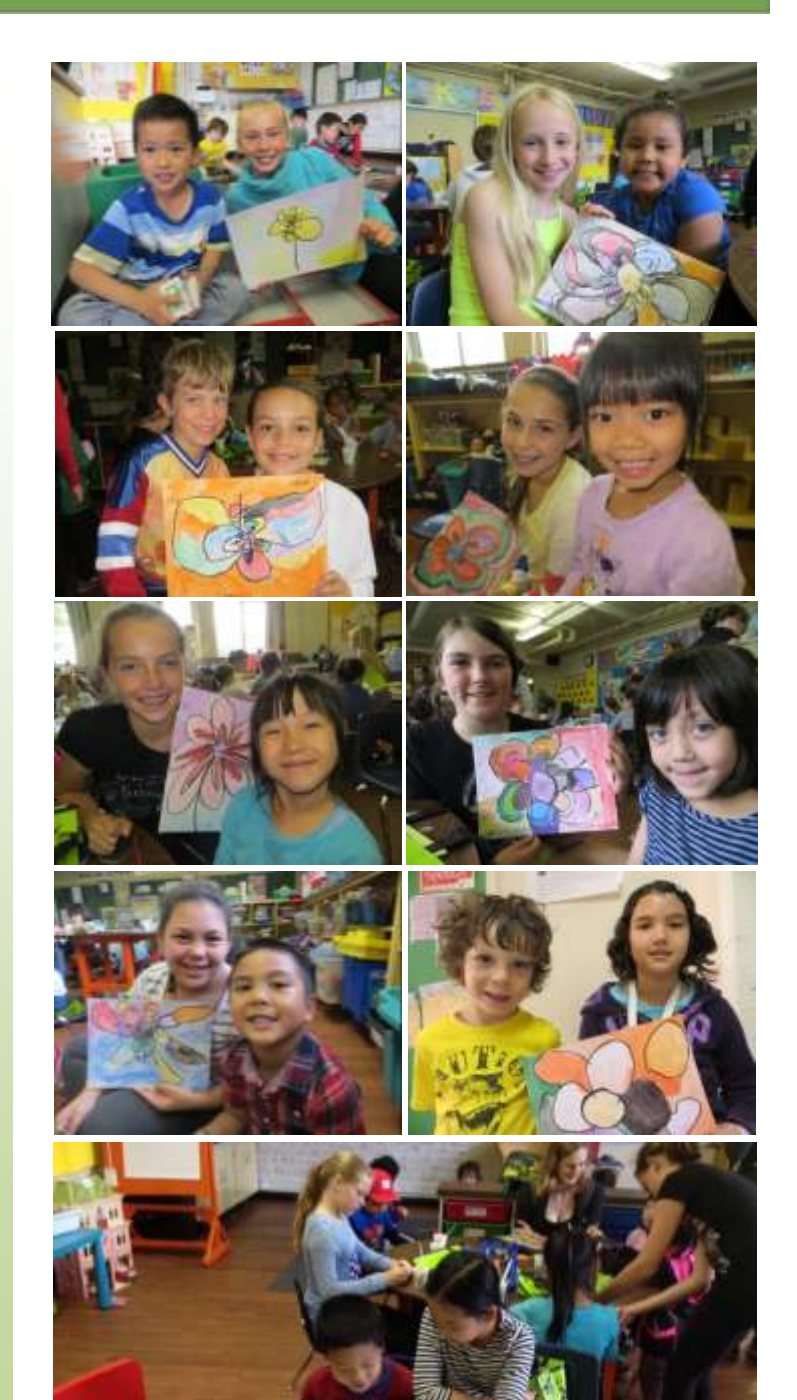
The kindergarten children made water-colour pictures for their big buddies. The big buddies gave their little buddies a picture of them and their little buddies (as seen in picture).